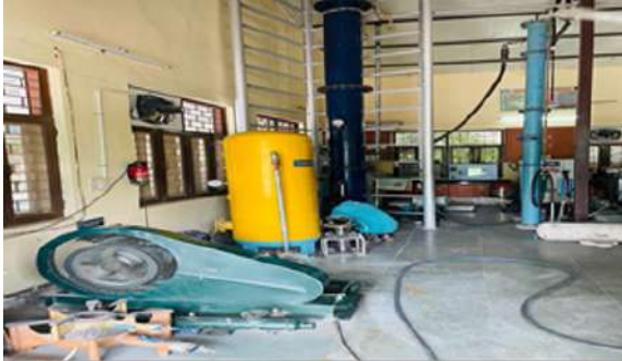
Biogas enrichment and bottling facility

minimising methane emissions. We are working with an NGO Chintan in this regard and plan to become a zero-waste campus soon.