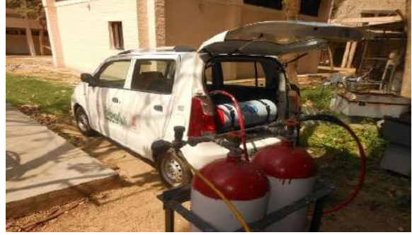
CBG filling in car