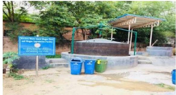
View of anaerobic digester running on kitchen waste

Horticultural waste is composted and used extensively on campus to conserve soil carbon. After segregating for recycling, only 50% of our solid waste reaches the landfills thereby