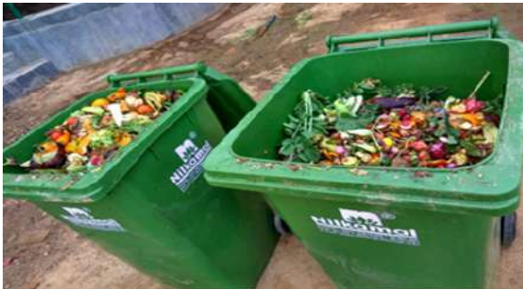
Segregated kitchen waste in IIT Delhi campus

IIT Delhi has dramatically improved its solid waste management in recent years. Waste from domestic, hostels and horticultural sources are collected from campus and biodegradable waste and recyclable waste are segregated. Biodegradable waste is used in biogas generation. A pilot-scale biogas production plant having a capacity of 25 m 3 /day has been established in the Mahatma Gandhi Gramodaya Parisar of IIT Delhi. This plant uses 250 kg of kitchen waste per day, segregated waste collected from various households and hostels inside the campus to produce biogas and compressed biogas (CBG) as demonstration models of proper waste management to produce fuel and biofertilizer for in-campus horticultural application. This activity was taken up under the institute’s initiative “Working Group on Waste Management”. The biogas produced by this plant is being upgraded to a quality of natural gas using a biogas purification and bottling plant situated in Biogas Production and Upgradation Laboratory. The biogas is being also upgraded by a water scrubbing-based system (20 Nm 3 /h of biogas) to upgrade it to natural gas quality fuel. Further, the upgraded CBG is being used as vehicular fuel to substitute CNG.