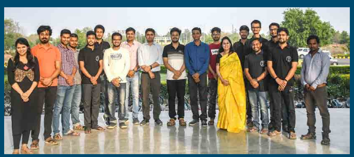
TPC team with volunteers of the year 2018-19

The motivated team of Training and Placement Cell is actively following Kaizen-the Japanese word for "improvement", in all spheres.