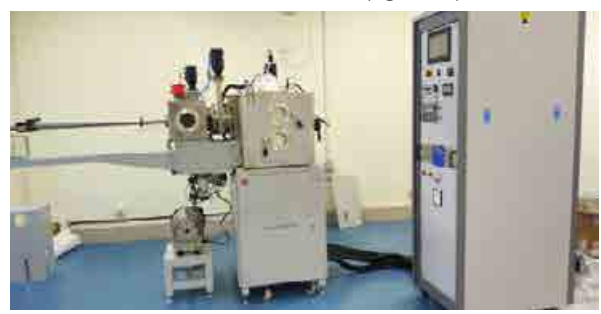
Fig 10: RF DC Sputtering Unit

RF DC Sputtering unit was installed as part of micro nano fabrication facility, for those companies who would like to work on sensors and mems level fabrication (Figure 10).