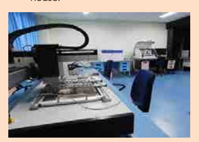
Fig 7: PCB Design & Manufacturing Lab

Testing and Calibration Lab (Figure 8) enables the characterization of PCB prototypes using advanced oscilloscopes, Function Generator, RSA, Logic Analyser, source meter and the like.