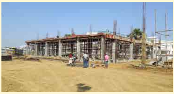
Fig 12.b: Construction Progress

As per the MoU, BRPNNL has demanded for Rs 49,221,000/-(Rupees Four Crores Ninety Two Lakhs and Twenty One Thousand only) which is 30% of the total estimated cost. The same has been released on 31 Dec 2018.BRPNNL subsequently reported 30% completion of the construction and informed utilization of Rs 344.92 lakhs and has raised demand for Rs 492.21 Lakhs.