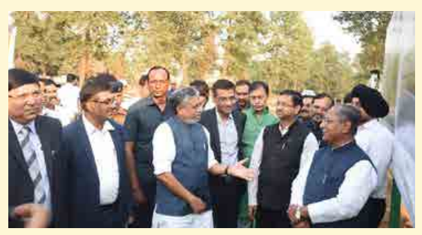
Fig 12.a: Construction Progress

The ground breaking ceremony of the IC permanent facility has been carried out by HonbleDy CM of Bihar Shri Sushil Kumar Modi on 24th November 2018 (Figure 12.a). The construction activity has commenced immediately afterwards. At present, the foundation of the building is complete and super structure is progressing (Figure 12.b) and is expected to completeby end of 2019.