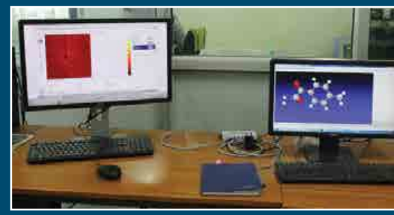
Data /structure on SC-XRD SAIF IIT Patna