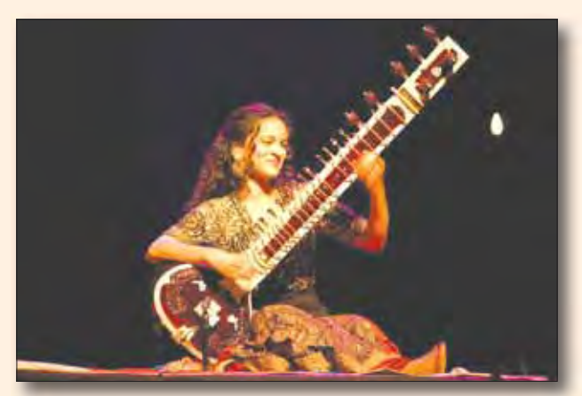
Anoushka Shankar, the famed Indian-American sitar player and composer performing at Alcheringa

Construction activities of the residences for faculty and non-faculty members are going on. On completion of all these by December 2012, the number of quarters will be F-type: 79, E-type: 114, D-type: 168, C-type: 72, and B-type: 175, for a total of 608.