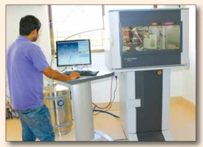
Single Crystal X-Ray Diffractometer

Single Crystal X-Ray Diffractometer – Rotating Anode X-Ray Diffractometer -` 1.47 crore