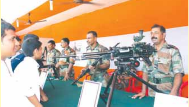
An exhibition of Indian Army at Techniche