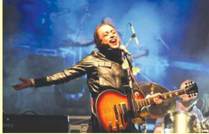
A musical band performing in Alcheringa