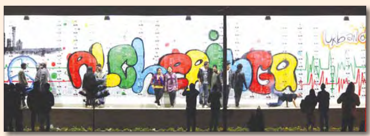
Graffiti wall of Alcheringa

One of the main attractions of Techniche is the Lecture