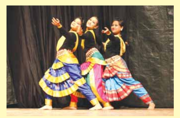
Cultural performance in Alcheringa