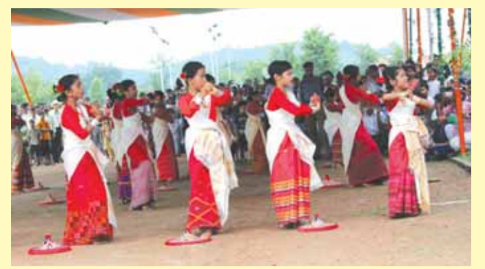
Campus children performing at the Independence Day ceremony